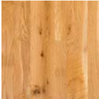
Water-based Polyurethane Pre-finish