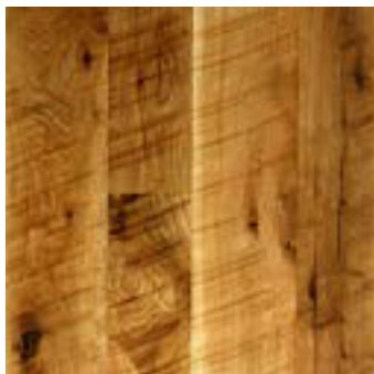
Oil-based Polyurethane On-Site Finish