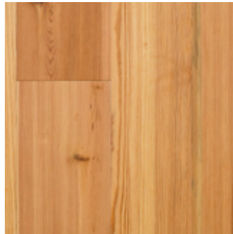
UV Standard Prefinish Reclaimed Antique Heart Pine (Select Grade)