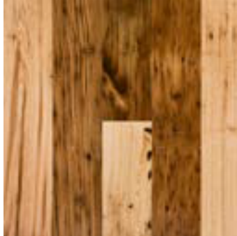
Water-based Polyurethane Pre-finish