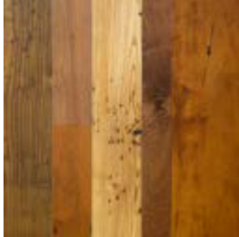
Water-based Polyurethane Pre-finish