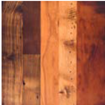
Natural Oil Pre-finish