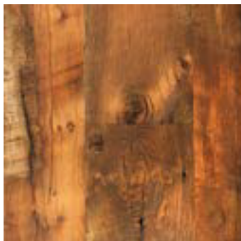
Oil-based Polyurethane On-Site Finish