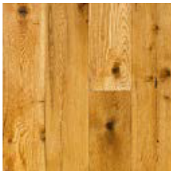
Oil-based Polyurethane On-Site Finish