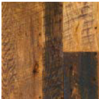
Oil-based Polyurethane On-Site Finish