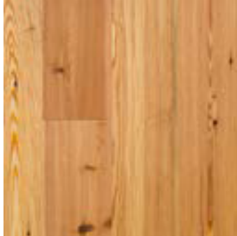
Water-based Polyurethane Pre-finish