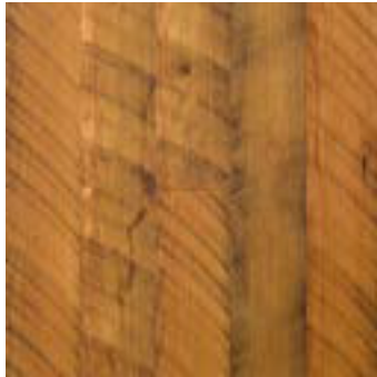
Water-based Polyurethane Pre-finish