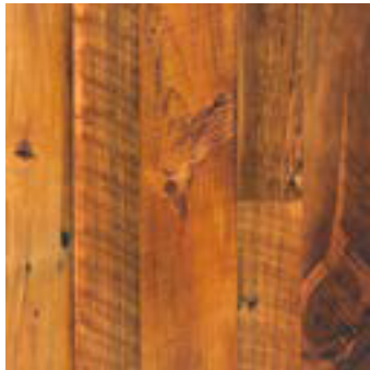
Natural Oil Pre-finish