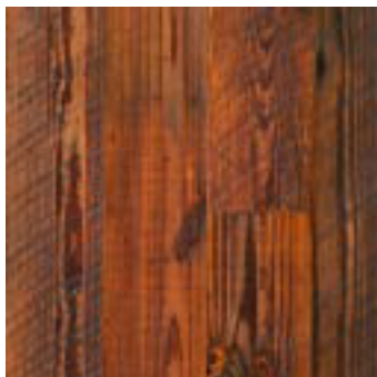
Oil-based Polyurethane On-Site Finish