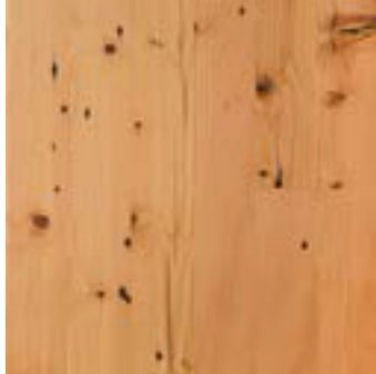
Water-based Polyurethane Pre-finish