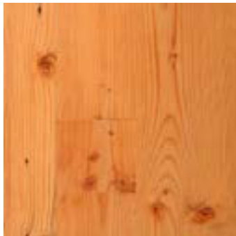
Oil-based Polyurethane On-Site Finish