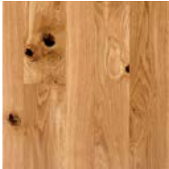
Water-based Polyurethane Pre-finish